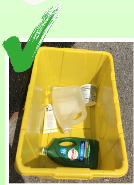
Acceptable Plastic Recycling Items

The photos below are an example of what a one-person household can and cannot recycle!