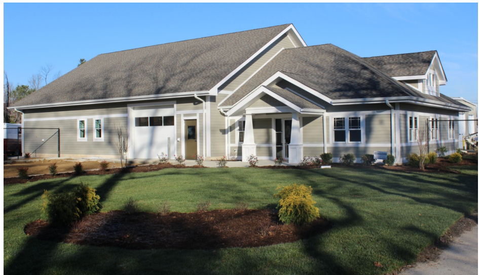
The new Department of Public Works building located at the corner of 11th Street and Dayton Avenue.