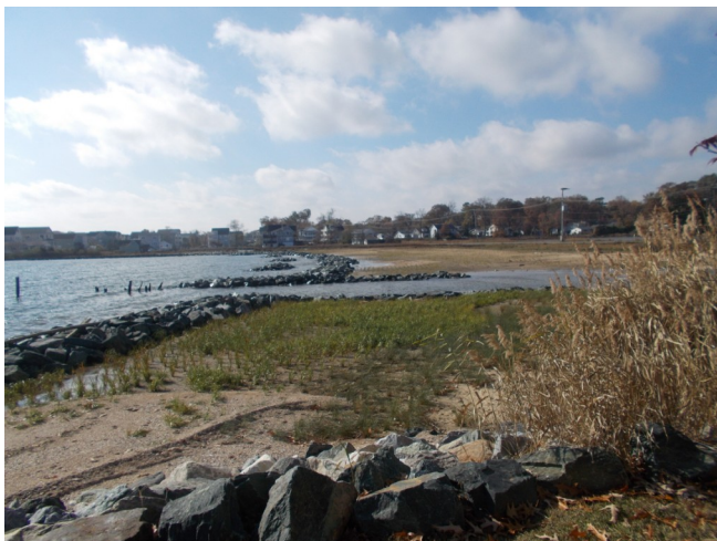
North Beach living shoreline looking south from Hooper property in Holland Point

Environmental Concerns from St. Michaels., MD has completed all the stone grading and initial planting work under their contract for which the town has a $550,00 Grant from the U. S. Fish & Wildlife Foundation. Environmental Concerns will return to the site in the spring to reestablish any plantings that do not survive the winter months.