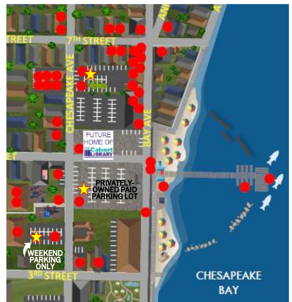
★ PARKING AREAS ● TOWN BUSINESSES

Parking is available in locations indicated by a yellow star. On-street parking is available; however, some areas are for resident parking only. Guests are encouraged to carpool, to be mindful of residential parking areas and pay attention to signage, especially on Annapolis Avenue, Atlantic Avenue and west of Chesapeake Avenue.